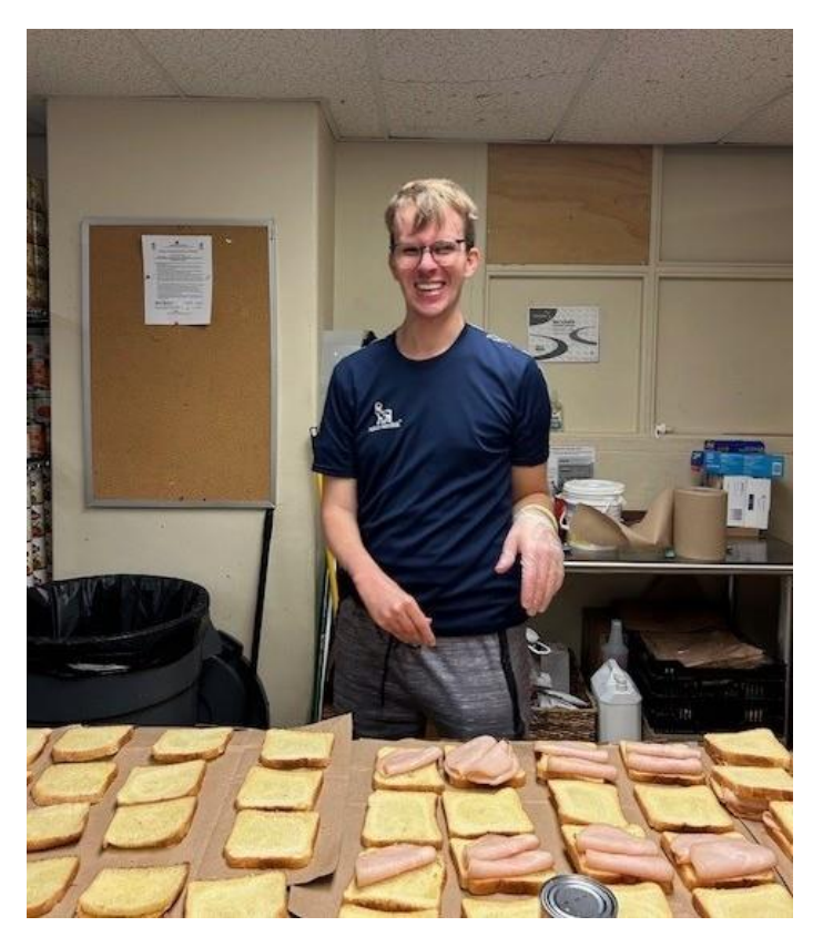
Fourth Presbyterian Church, Chicago Lunch bag assembly and distribution