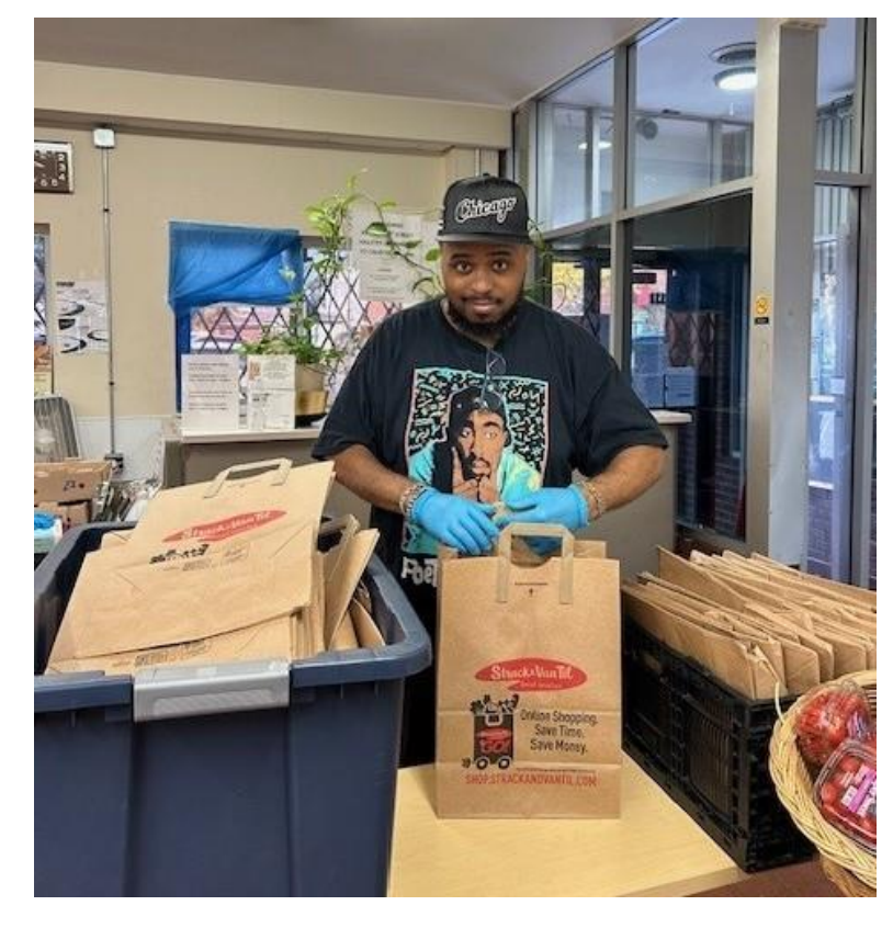
Casa Catalina, Chicago Food Pantry