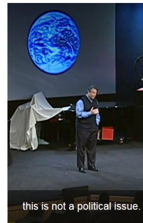
Al Gore: Averting the climate crisis 2006